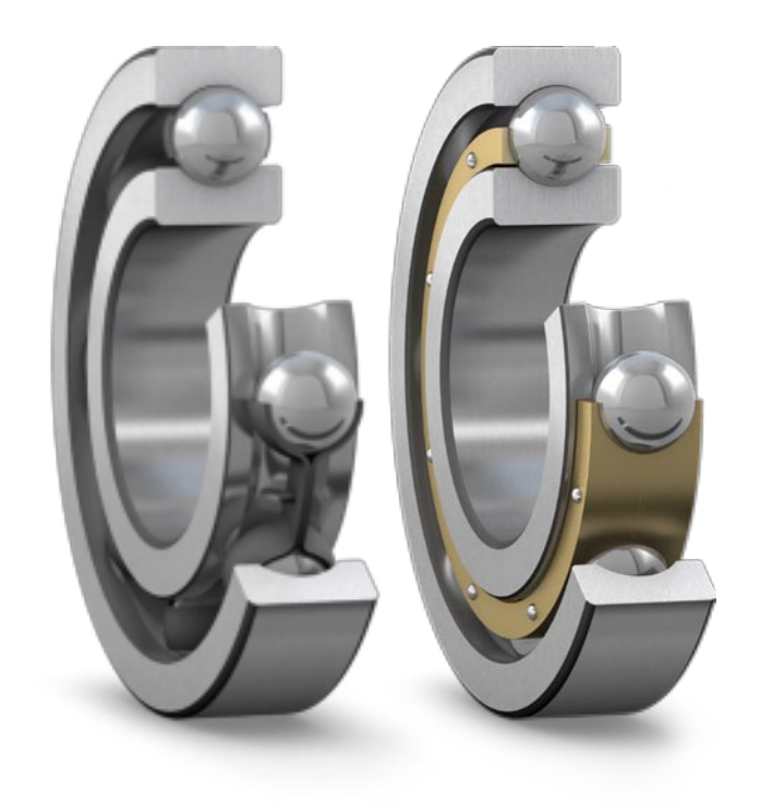
SKF Quiet Running Bearings are available with a steel or brass cage.

Because they are fully interchangeable with existing deep groove ball bearings, SKF Quiet Running Bearings can be used without modifying the rotor shaft or end shield. They are available with either an optimized brass cage or the new design steel cage.